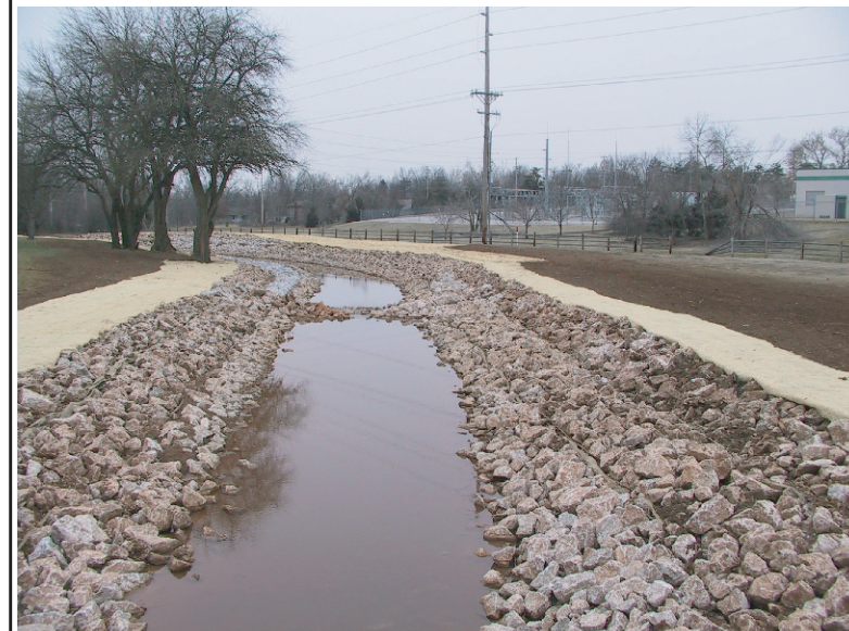
Looking downstream from lower cart bridge to station 1,000