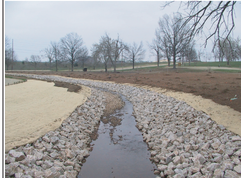
Looking upstream from lower cart bridge from station 500